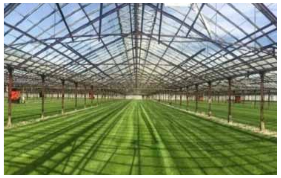
Growing turf in greenhouse in Odense for Saint Petersburg