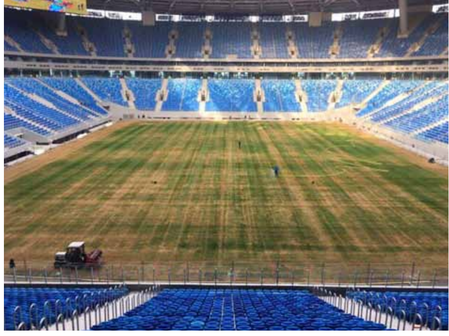
Initial pitch failure in 2016 and 2017

The old pitch was removed under my supervision in December 2017. Under the competent eye of Offaly excavator driver Dominic Cross, the pitch was removed and replaced over a 2 week period, stretching right through Christmas including Christmas day. The roof was closed, so a comfortable 15 degree environment sheltered us from the raging snow and cold of -20°C outside. A new rootzone was fully tested and