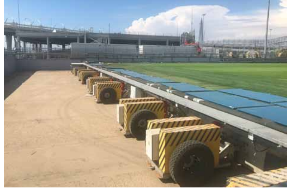
Electric motors to move the pitch in and out of the stadium