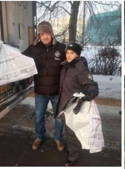
Customs officers and Russian Department of Agriculture had to inspect every turf load to ensure phytosanitary regulations were adhered to. Each of the 1220 turf roles had an ID number

The turf was harvested and transported for 72 hours across a journey of 3000 km. The logistical challenges of keeping turf alive in fridge wagons over logistically challenging jobs such as this cannot be underestimated. Combining this with phytosanitary and customs clearance time and procedures was a challenge. Thankfully, the project was supported by the Russian Government who were a huge help in this aspect.